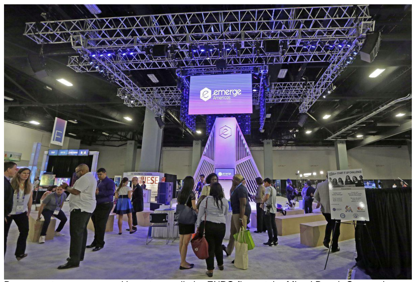
Buyers, entrepreneurs, and investors walk the EXPO floor at the Miami Beach Convention Center, Tuesday, June 13, 2017, in Miami Beach, Florida. EMerge Americas is a platform for the advancement of technology, a forum for idea exchange, and a launch pad for innovation connecting Latin America, North America, and Europe.