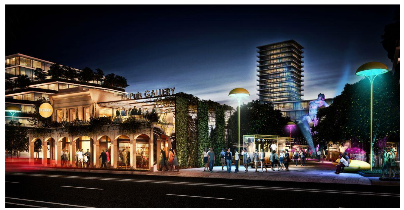
An early rendering of the Magic City Innovation District

told the <u>Miami New Tropic</u> that true parity was a long way away. When Hatcher was asked about challenges facing the local tech scene by the <u>Miami Herald</u>, she said "<u>the inclusion of minority communities</u> is still not a priority."